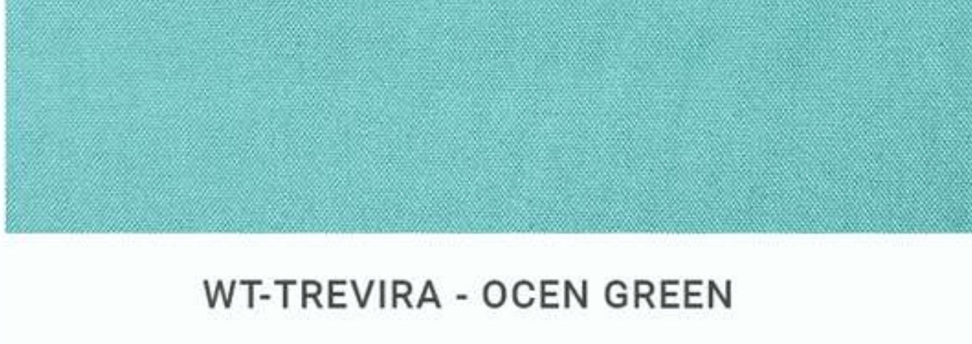
WT-TREVIRA - OCEN GREEN