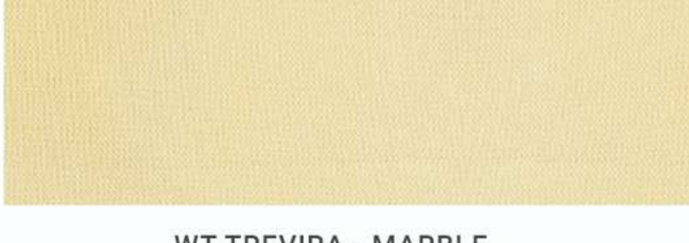
WT-TREVIRA - MARBLE